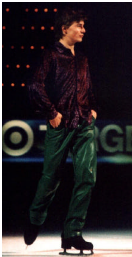
Mr. Big Stuff!